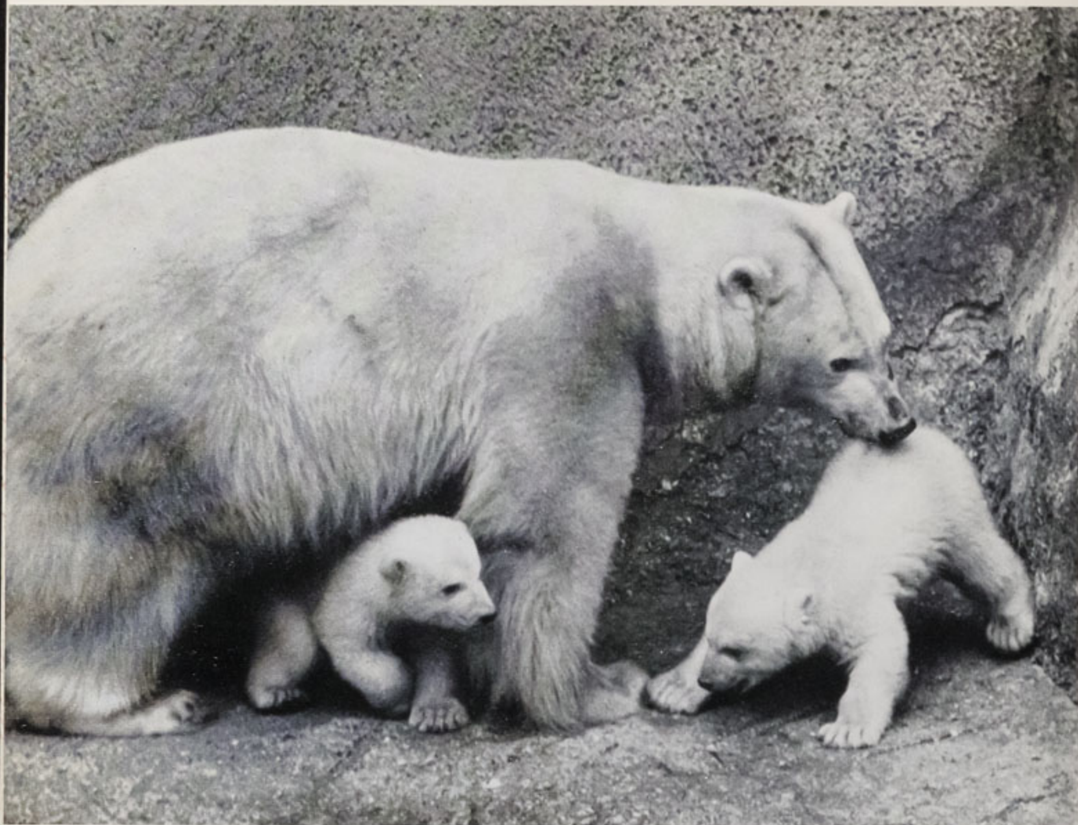
Polar Bear cubs at Whipsnade Park