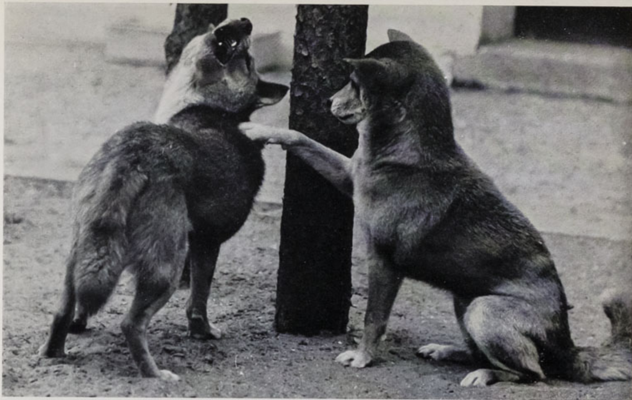
New Guinea 'Singing' Dogs, deposited by Sir Malcolm Sargent at the London Zoo