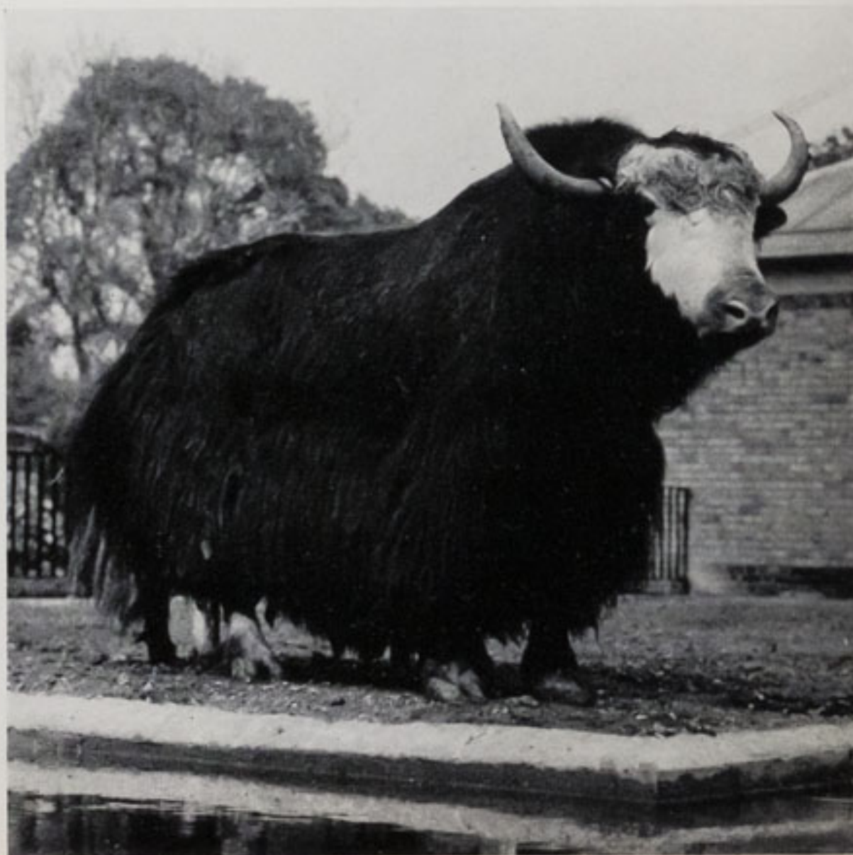
Yak in a paddock of the Cotton Terraces, London Zoo