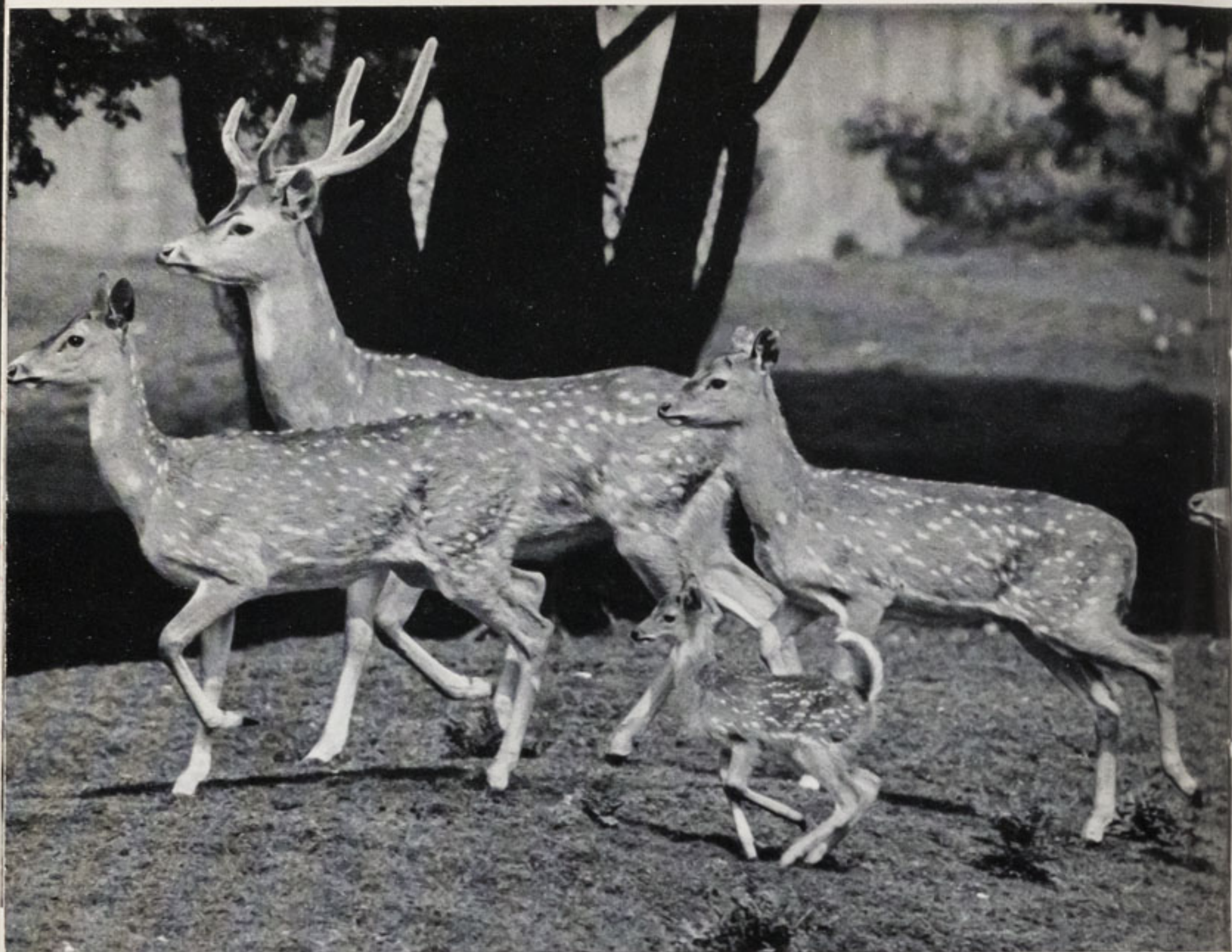
Axis Deer at Whipsnade Park Daily Telegraph