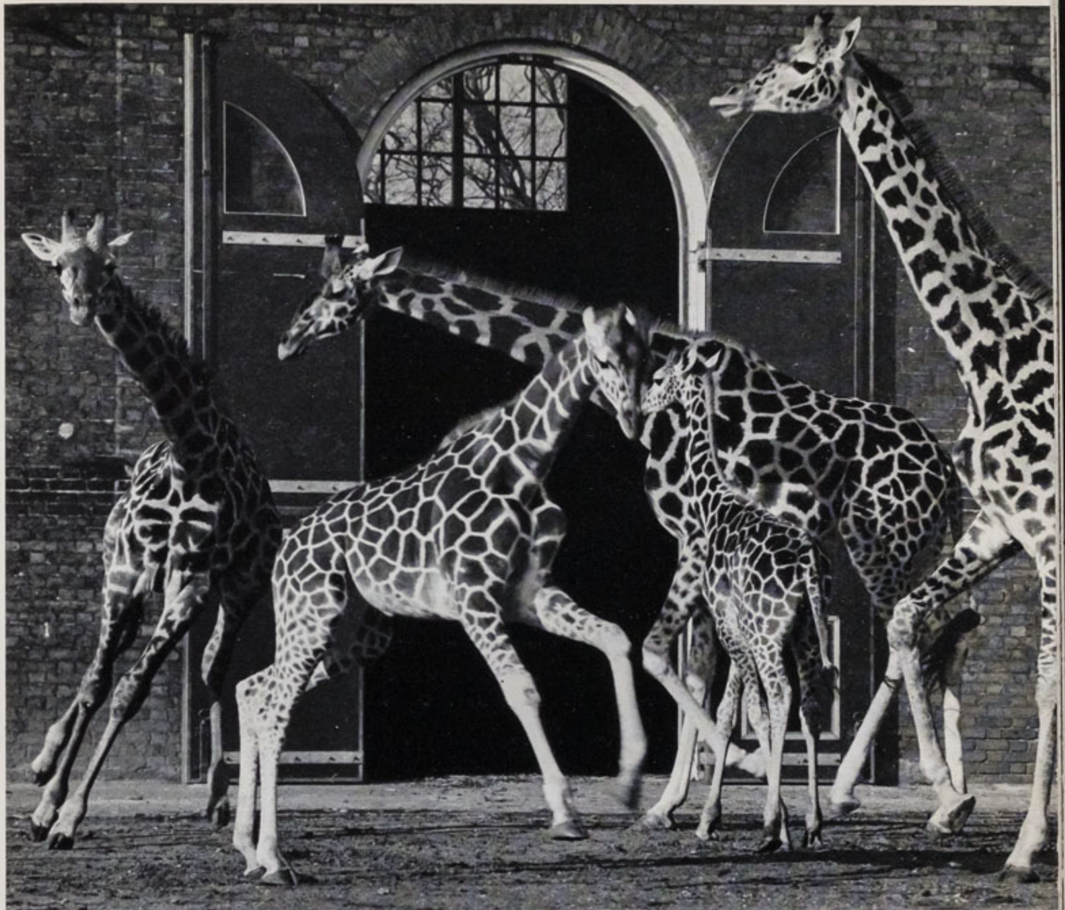
Giraffes in the London Zoo