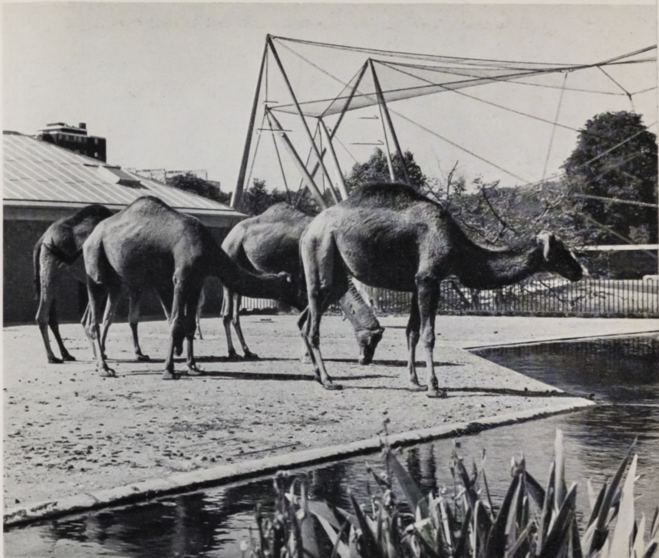
The Camel paddock of the Cotton Terraces, London Zoo