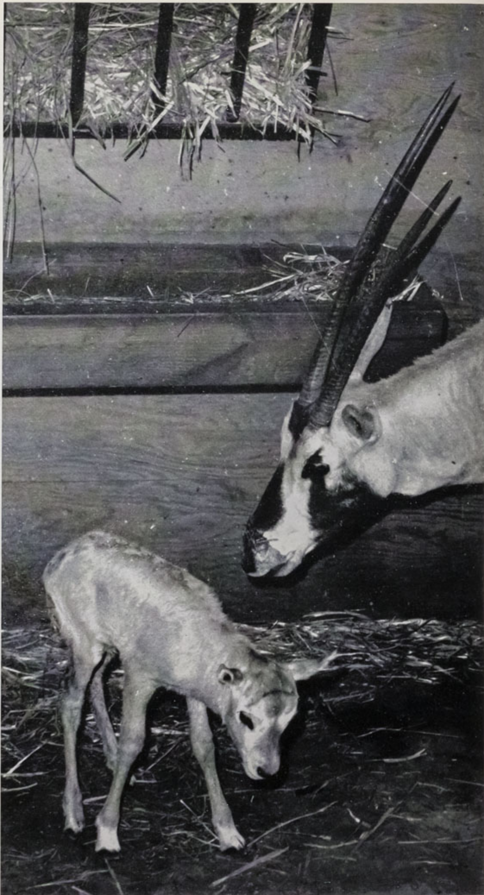
Arabian Oryx.. 'Michael', calf born to 'Caroline' the Arabian Oryx sent in May, 1963 from the London Zoo to the herd collected together by the Fauna Preservation Society at Phoenix Zoo, Arizona