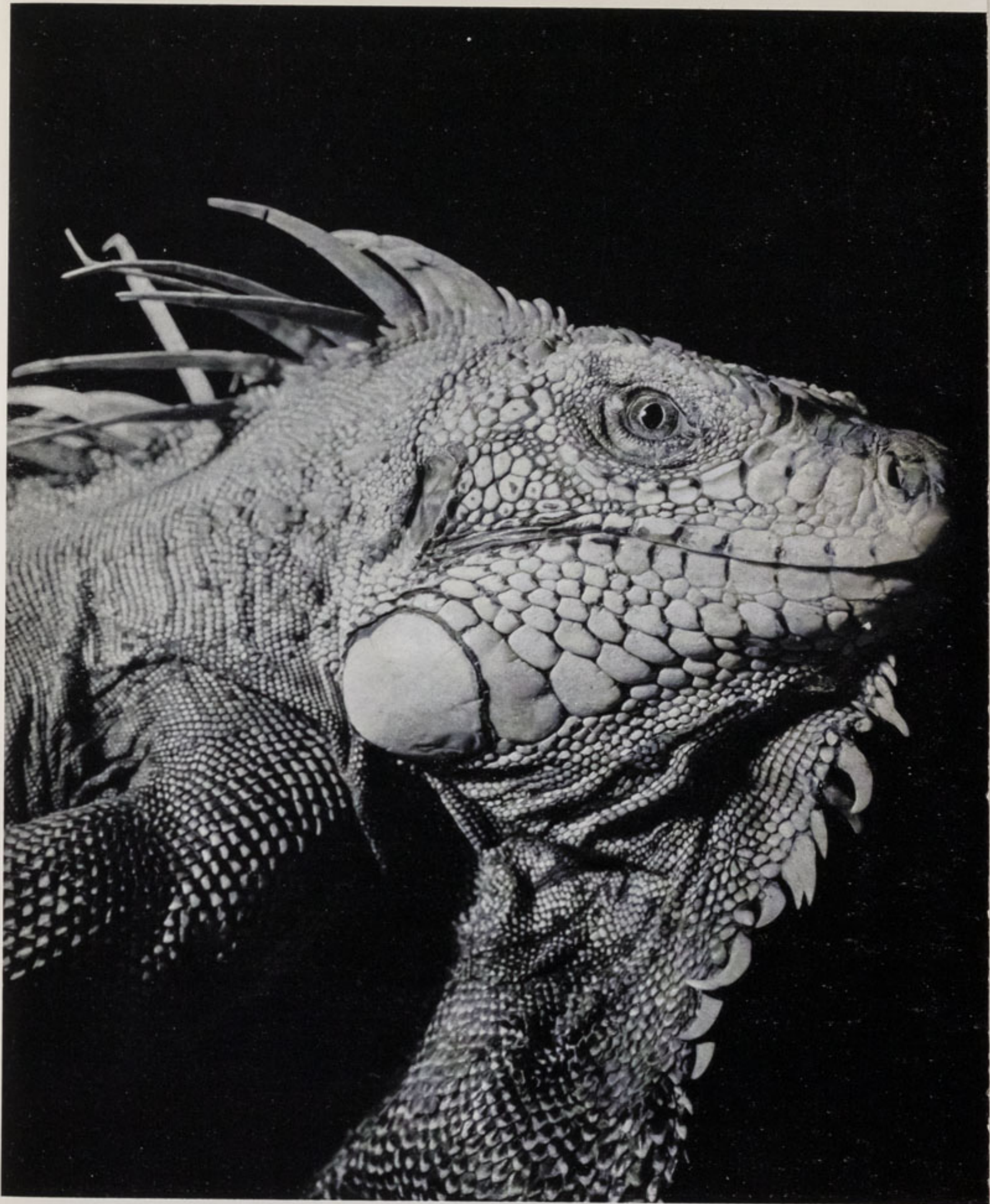
Iguana in the London Zoo