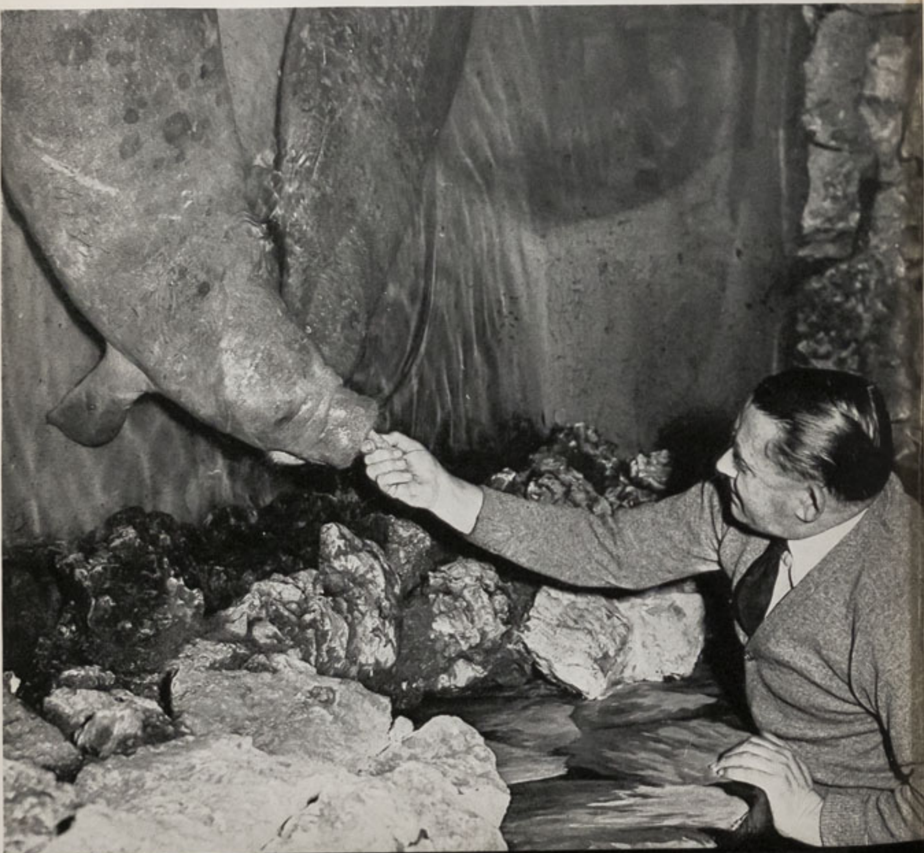
The Manatees, collected by the British Guiana Expedition, 1955, quickly became at home in their new quarters.